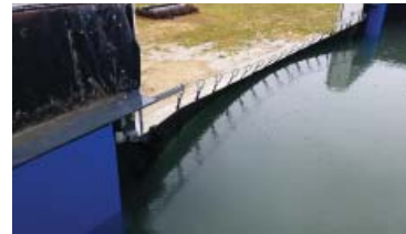
6' WATER LOADING TEST